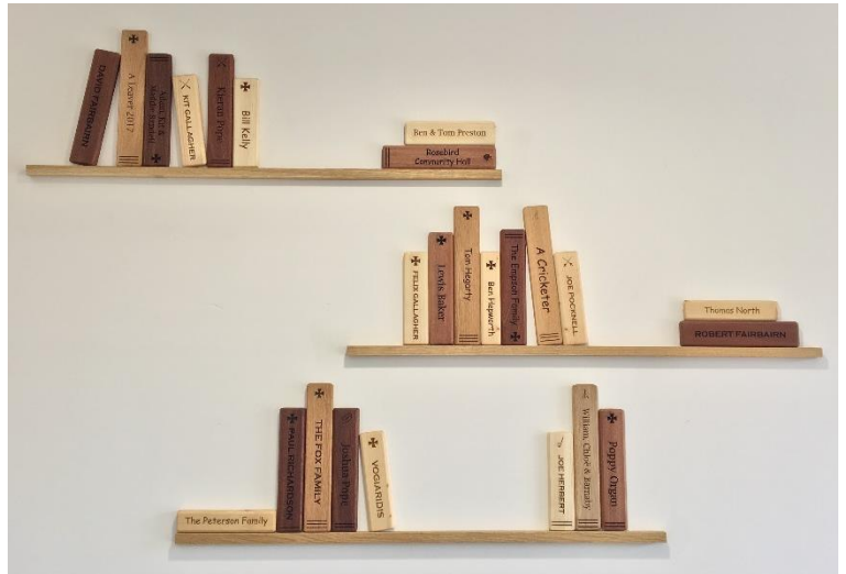
Donor Wall in Spender Building

If you are a UK tax payer, you can increase your gift to us by 25% through Gift Aid.